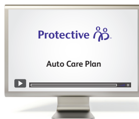
Consumer Webpage & Video Usage: A webpage and video are available for consumers to learn more about the Protective Auto Care Plan. A dealership can post a link on their website directing consumers to this webpage and video. To utilize this webpage please contact your Protective representative.