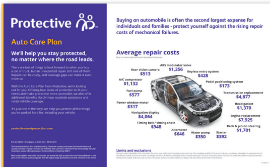
Placemat Usage: Use during sales presentation. Provides an overview of coverage and benefits. Size: 14" x 8.5" (Double-sided) Item Number: PACP-PM