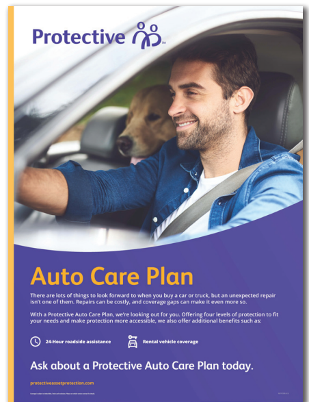
Poster Usage: Post throughout dealership. Size: 18" x 24" Item Number: PACP-POSTER