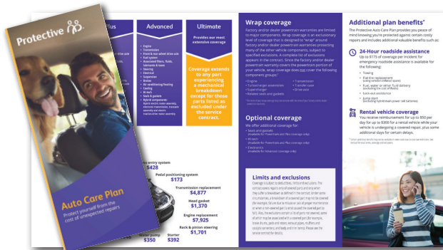
Brochure Usage: Use as a point-of-sale marketing tool. Size: 3.7" x 8.5" (folded) Item Number: PACP-B

To order these materials simply log on to F&I Café and fill out the Protective Auto Care Plan supply order form and submit to Protective.