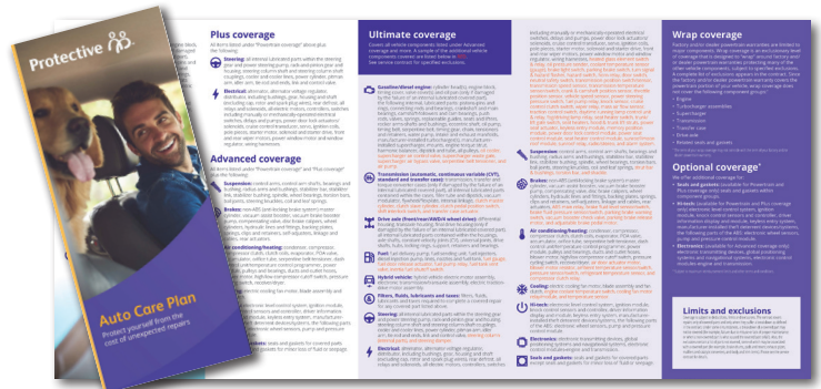
Brochure - Coverage Detail Version Usage: Use as a point-of-sale marketing tool. Size: 3.625" x 8.5" (folded) Item Number: PACP-B-D